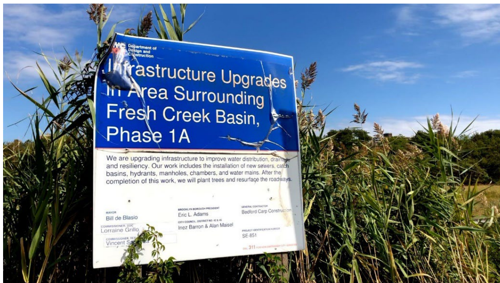
City signage provides information about infrastructure upgrades in Fresh Creek Basin.

More effective and equitable community engagement processes. City government-led community engagement efforts have required a lot of time and resources from community organizations, which has resulted in mistrust when residents do not understand how or if their input is being used. In tallying the number of plans, reports, and studies that the City of New York has released since Superstorm Sandy, one organizer recalls counting over 80 documents. Another was exasperated at the lack of government coordination of engagement processes, having voiced the same set of community priorities to different agency representatives at various public forums and listening sessions. On the other end of the spectrum, some neighborhoods—like Canarsie—have felt overlooked, and said that getting the attention of decision-makers is their biggest challenge. The range of experiences communities have had when engaging the City underscores the need for better, more streamlined, and more inclusive policies and processes that are tailored to the communities most at risk.