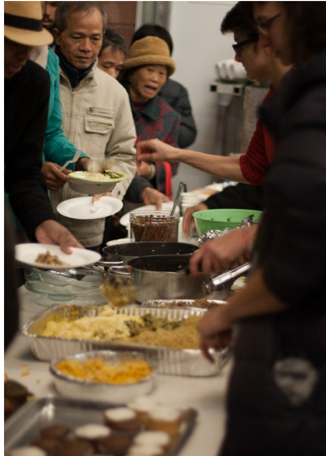
Residents at Red Hook Initiative for a hot meal after Superstorm Sandy.

Under such a community preparedness program, participating organizations would also be on-call for activation in the event of a disaster. The City already maintains an existing set of on-call emergency contracts for debris removal, emergency shelter, environmental testing and remediation, building assessment and demolition, and various other functions geared toward physical recovery—none focus explicitly on community services or designed for community organizations to access. This existing model should be expanded to include community services. To start, the City and interested community groups should jointly identify the types of activities best suited for communities to lead, alongside an appropriate level of funding for carrying out these on-call services. For instance, community organizations could be contracted to canvas potentially vulnerable neighbors and inform government officials about residents' needs for safety, heat, power, shelter, or food; coordinate food distribution efforts; and connect people to housing, financial, or legal assistance.