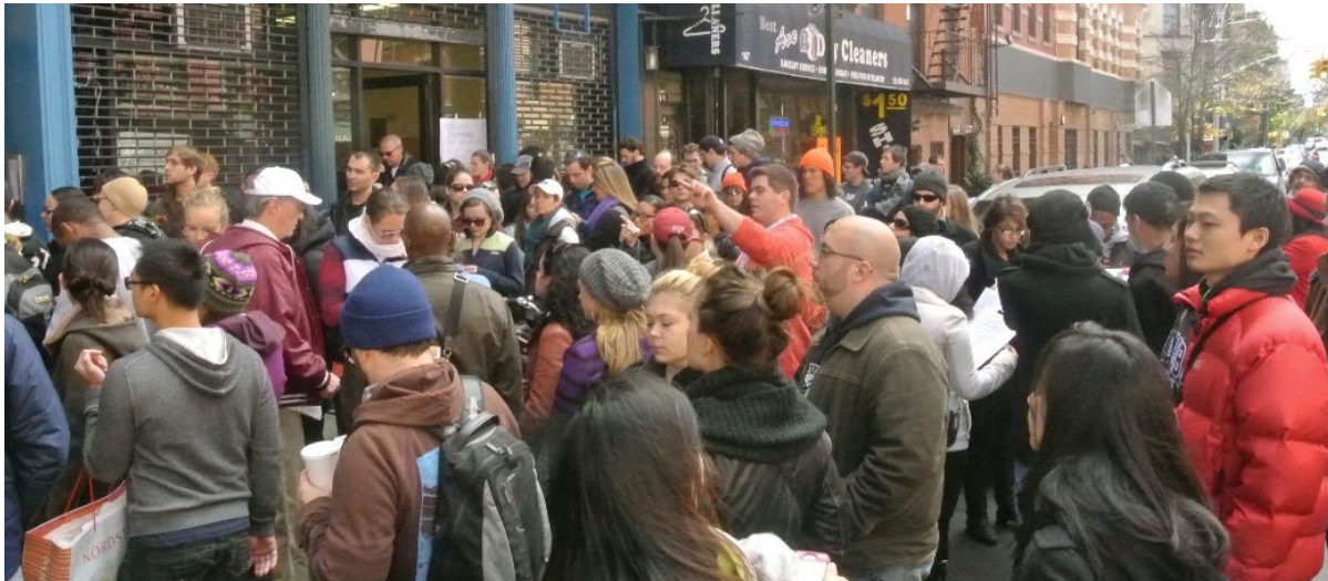
Volunteers gather outside the GOLES office in the days after Superstorm Sandy.

New York City was unprepared for Superstorm Sandy. In the days following the storm, community organizations characterized the local and federal government’s response as inadequate, slow, uncoordinated, and poorly communicated. As a result, communities across New York City mobilized to provide essential services to those in need—they performed wellness checks on neighbors, distributed food and water, shared information and resources, and opened their physical spaces to those in need of shelter or a place to gather and organize. Established nonprofits led some efforts, while newly formed volunteer mutual aid drove others. Many community groups did not have prior training or experience in emergency response—their efforts required determination and creativity to secure resources to meet urgent needs.